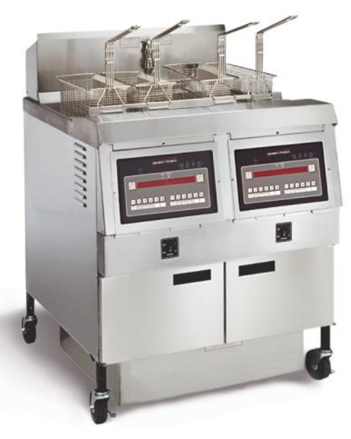
OFG 322 2-well gas open fryer with Computron<sup>™</sup> 8000 control

Henny Penny open fryers offer high-volume, integral multi-well frying with programmable operation, oil management functions and fast, easy filtration.