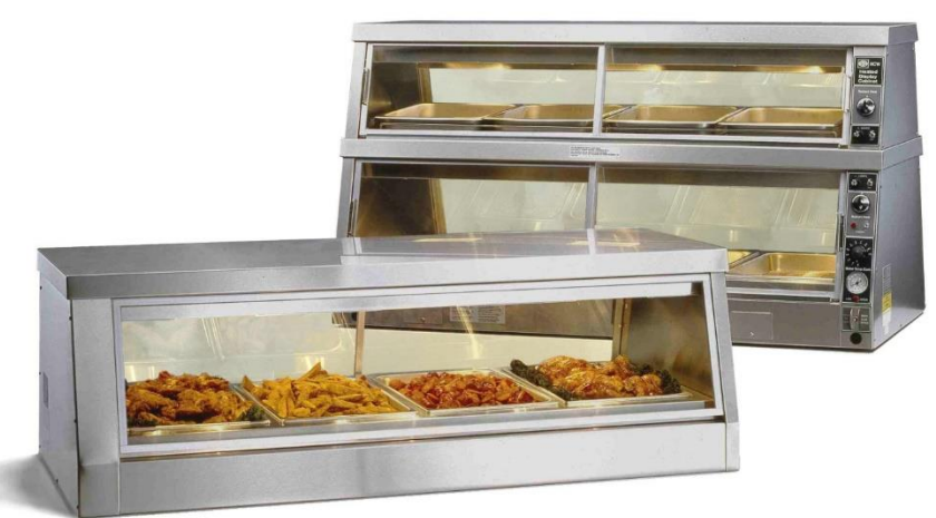
CW 114 single tier and CW 216 two tier display counter warmers

Henny Penny display counter warmers are designed for accumulating, holding and displaying hot fresh food for serving or packing at the point of sale in retail foodservice operations.