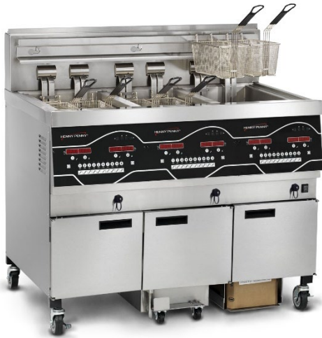
EEE 143 3-well open fryer