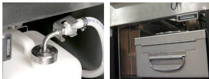
Oil replenished automatically from JIB for multi-well (left) or reservoir for 1-well (right)

Henny Penny Evolution Elite® open fryers use innovative filtering and oil level technology to extend oil life, improve product quality and reduce overall oil consumption and costs. Here's how: