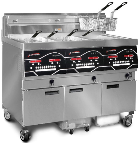
EEG 243 3-well gas open fryer