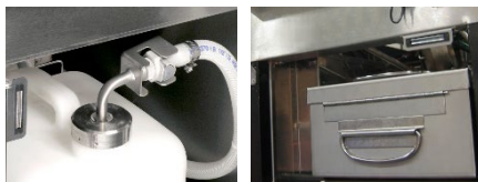
Oil replenished automatically from JIB for multi-well (left) or reservoir for 1-well (right)

Henny Penny Evolution Elite® open fryers use innovative filtering and oil level technology to extend oil life, improve product quality and reduce overall oil consumption and costs. Here's how: