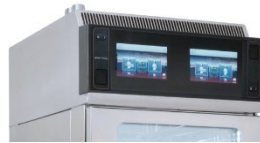
Available without integrated hood as FSD 610/610