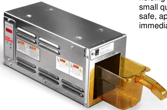
MPC 1L modular multi-purpose holding cabinet

Henny Penny multi-purpose holding cabinets are ideal for keeping small quantities of hot menu items safe, appetizing and ready for immediate serving or packing.