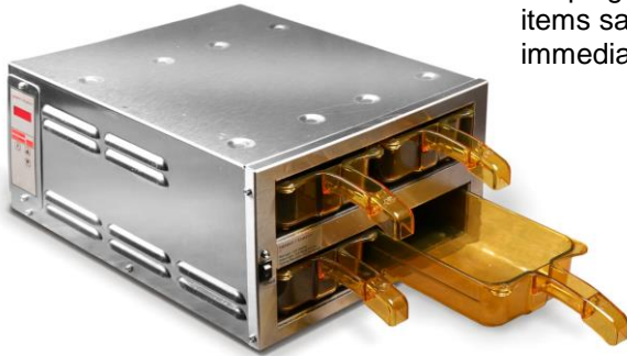
MPC 22 modular multi-purpose holding cabinet

Henny Penny multi-purpose holding cabinets are ideal for keeping small quantities of hot menu items safe, appetizing and ready for immediate serving or packing.