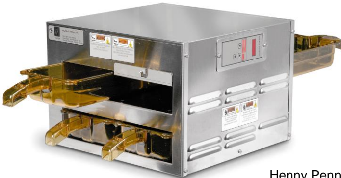
MPC 222 dual access modular multi-purpose holding cabinet

Henny Penny multi-purpose holding cabinets are ideal for keeping small quantities of hot menu items safe, appetizing and ready for immediate serving or packing.