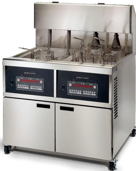
OEA 342 2-well large capacity auto lift electric open fryer

OEA 341 1-well electric OEA 342 2-well electric