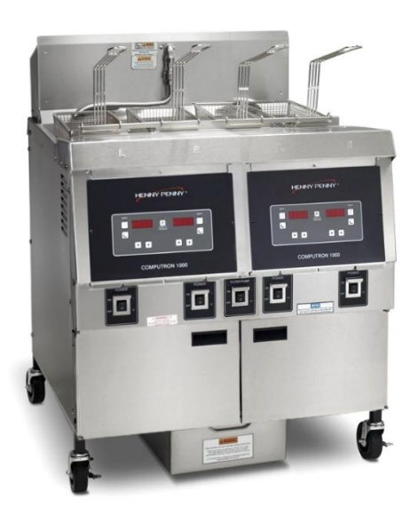
OFE 322 2-well electric open fryer with split vats and Computron<sup>™</sup> 1000 control

Henny Penny open fryers offer high-volume, integral multi-well frying with programmable operation, oil management functions and fast, easy filtration.