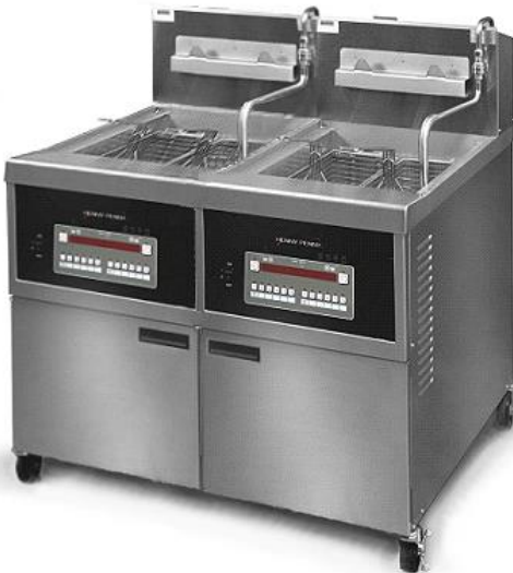
OFE 342 2-well large capacity electric open fryer with Computron™ 8000 control

OFE 341 1-well electric OFE 342 2-well electric