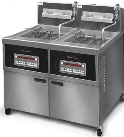
OFG 342 2-well large capacity gas open fryer with Computron™ 8000 control

Henny Penny open fryers offer high-volume frying with programmable operation, oil management functions and fast, easy filtration.